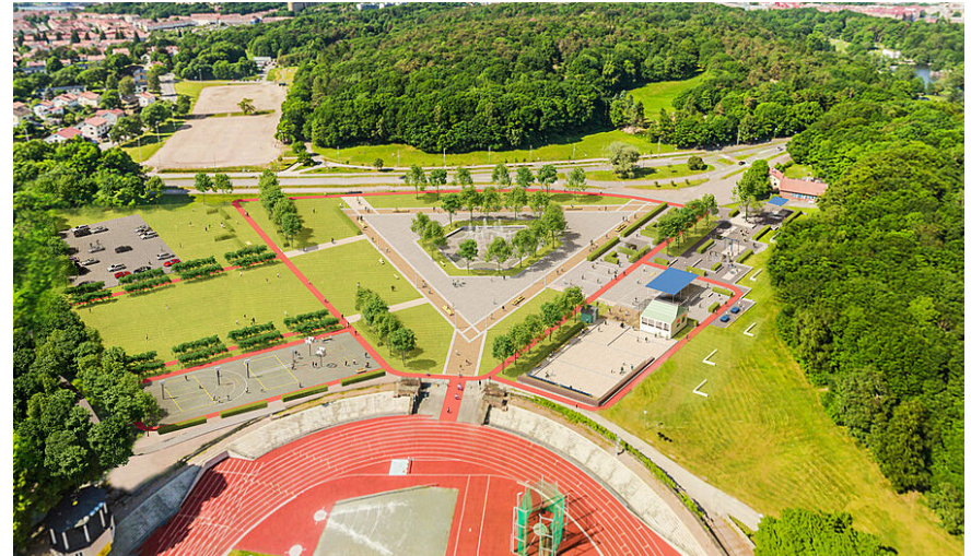
ATHLETE'S VILLAGE - MAP #3